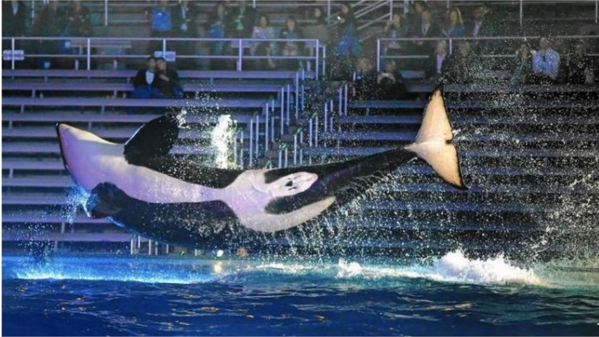
An orca leaps above its pool during a performance at SeaWorld San Diego.